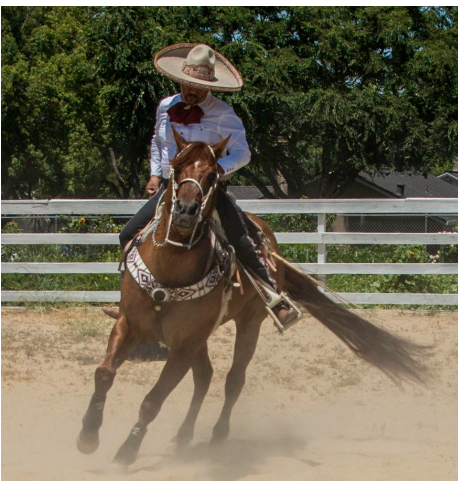
A member of the El Ranchero Charro Team performs.