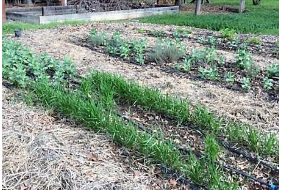
Above: Heritage Garden in January 2018.

Speaking of spring, the Heritage Garden will be having work days on March 10th and 31st and April 8th, 14th, and 21st, starting at 10am each morning. We look forward to planting red oats this spring, specifically the famous Livermore Red Oat Hay which was once fed to winning race horses like the great Seabiscuit. Heirloom varieties of cucumber, tomato, eggplant, and melon will also be planted along with the three sisters: corn, beans, and squash. To join the gardening team contact Loretta Kaskey (lorkaskey@gmail.com) or show up on one of the garden work days.