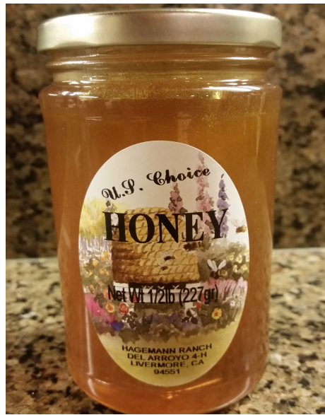
Above: a jar of the new Hagemann Honey.

The year 2018 began with an Antiques and Valentine's theme. On a sunny January 28 th antique dealers filled the barn with items for sale and display. The kids were busy with cookie decorating and making Valentine's crafts. For the first time, we had volunteers from the National Charity League helping with the kids' activities. A local flute quintet, The Silverwinds, serenaded us from the Blacksmith Shop. The Livermore Lions Club offered free vision screening for all. For the first time we had a Mystery Antique game. For those of you who wondered what that heavy stone thing with a handle actually is, it is a bed