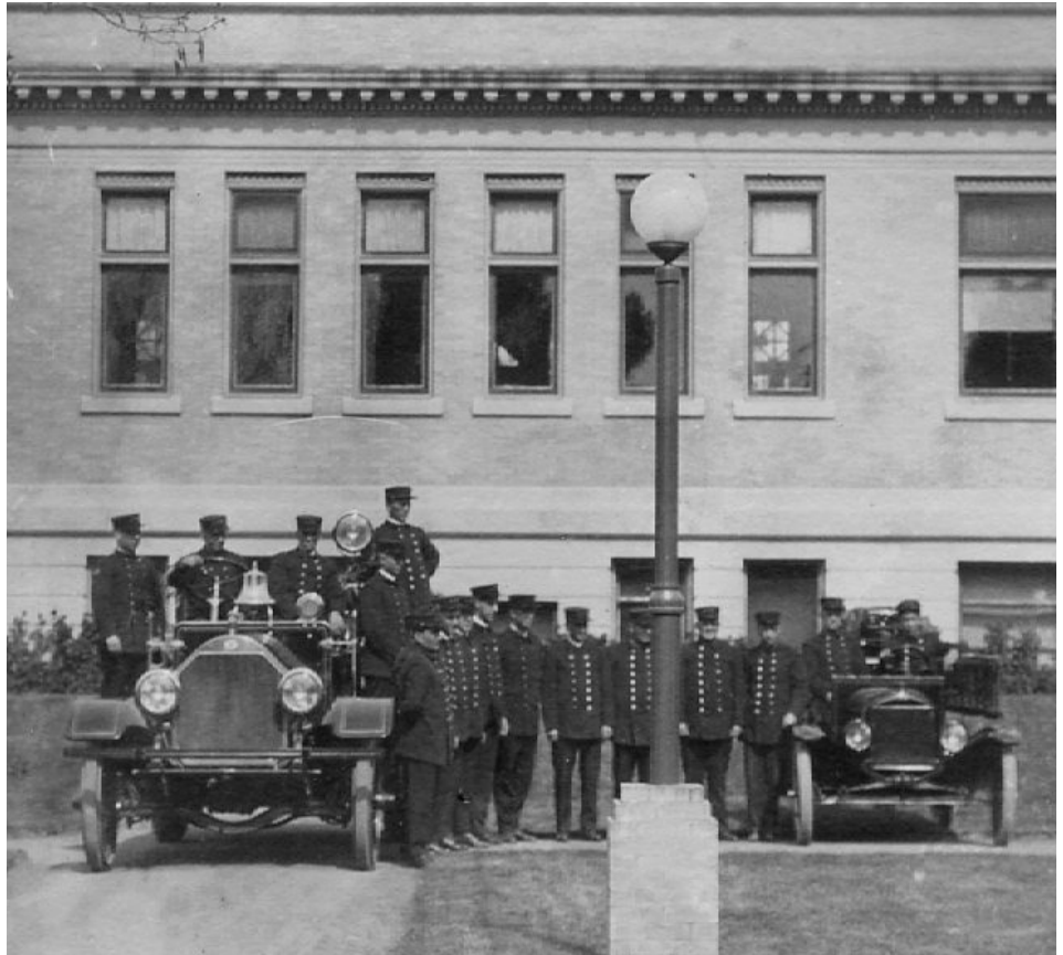
Above: Detail of a black and white 3 in x 5 in postcard, looking east from K St at the Carnegie Library. The photo appears to be of the Livermore fire department with the 1920s Seagrave. The Ford pumper truck may be in photo as well.