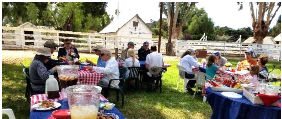
Above: The Thank You Luncheon for the work crew from First Presbyterian Church, Livermore.

As you can see, a lot of local groups contribute to creating an interesting and educational experience for guests at the Sunday at Hagemann events. We at the Guild are so very grateful to all who volunteer and spend their time with us. Together we are creating a community gathering place.