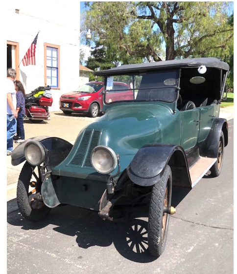
Above: A Franklin Automobile visits the Duarte Garage on September 16 as a part of the Lincoln Highway Association annual tour.

The Lincoln Highway Association planned its 2019 annual tour to follow the route of the MVPA Centennial Convoy a couple of days behind the military vehicles. The LHA group, driving non-military vehicles, planned months in advance to have a lunch stop at the Duarte Garage. Livermore Heritage Guild volunteers manned the food table, conducted tours of the Garage, answered questions, and thoroughly enjoyed talking to the LHA visitors. We look forward to the next Centennial Military Convoy in 2119.