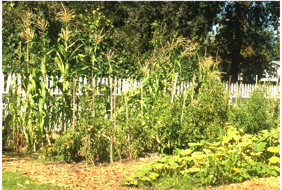
Above: We are eyeing the beds of pumpkins, tomatoes and corn as their time to be removed is coming.