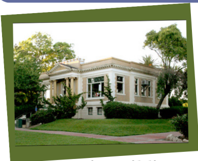
Carnegie Building Appetizers and Beverages