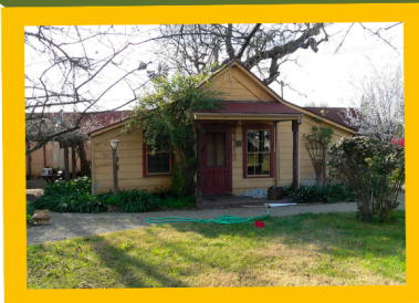
Hagemann Ranch (and the HistoryMobile) Tri-tip and sides