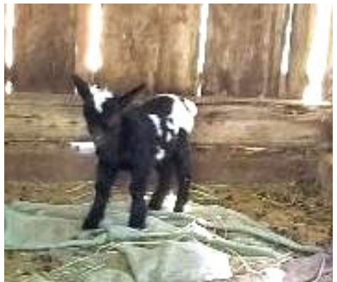
Top: Members of the riding program with the Best in Livermore award. Above: New resident baby goat.