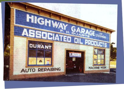
Duarte Garage Dessert Selection

Non-Member: $35 Member: $30 Children 3-10: $20 Children under 3: free