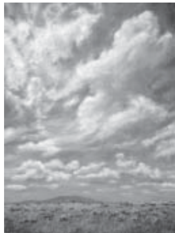
Painting from 'Land and Sky' series.