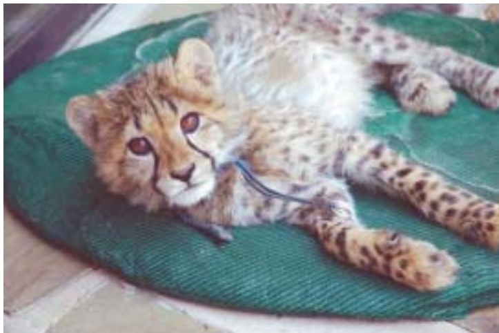
One of the Cheetah cubs Vicki worked with.

The other problem for cheetahs is the change in habitat caused by domestic animals' overgrazing. When the natural grasses are reduced to stubble or removed, acacia trees have space