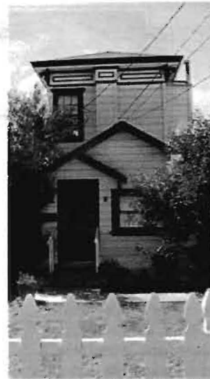
Tankhouse/house on Sixth Street

Outside of town, the one-room Highland School, built in 1922 at the southeast corner of Carneal and Highland Roads, still includes a rather fat little tankhouse that was used traditionally for storing and pumping water. However, the bottom area was used for storing coal. There was a hole on the north side, a chute for coal delivery. Older students carted coal for the school stove from the tankhouse. At the Valentine and Josefa Livermore Alviso house, on a knoll to the west of North Livermore Avenue just north of Interstate 580, there is a tankhouse behind the house. An architect who dated the house at about 1892, said that the dilapidated tankhouse is